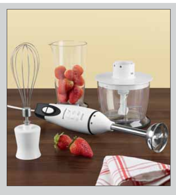
GB Hand Blender Set Operating instructions

KOMPERNASS GMBH BURGSTRASSE 21 · D-44867 BOCHUM www.kompernass.com ID-Nr.: SSMS 300 A1-02/10-V1