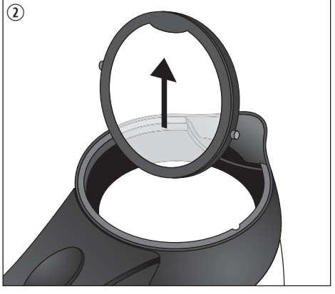
Download from Www.Somanuals.com.-All Manuals Search And Download.