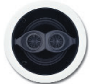
Extreme XSSTR In-Ceiling Speaker