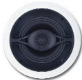
Extreme XTR In-Ceiling Speaker