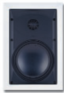
Extreme XT In-Wall Speaker