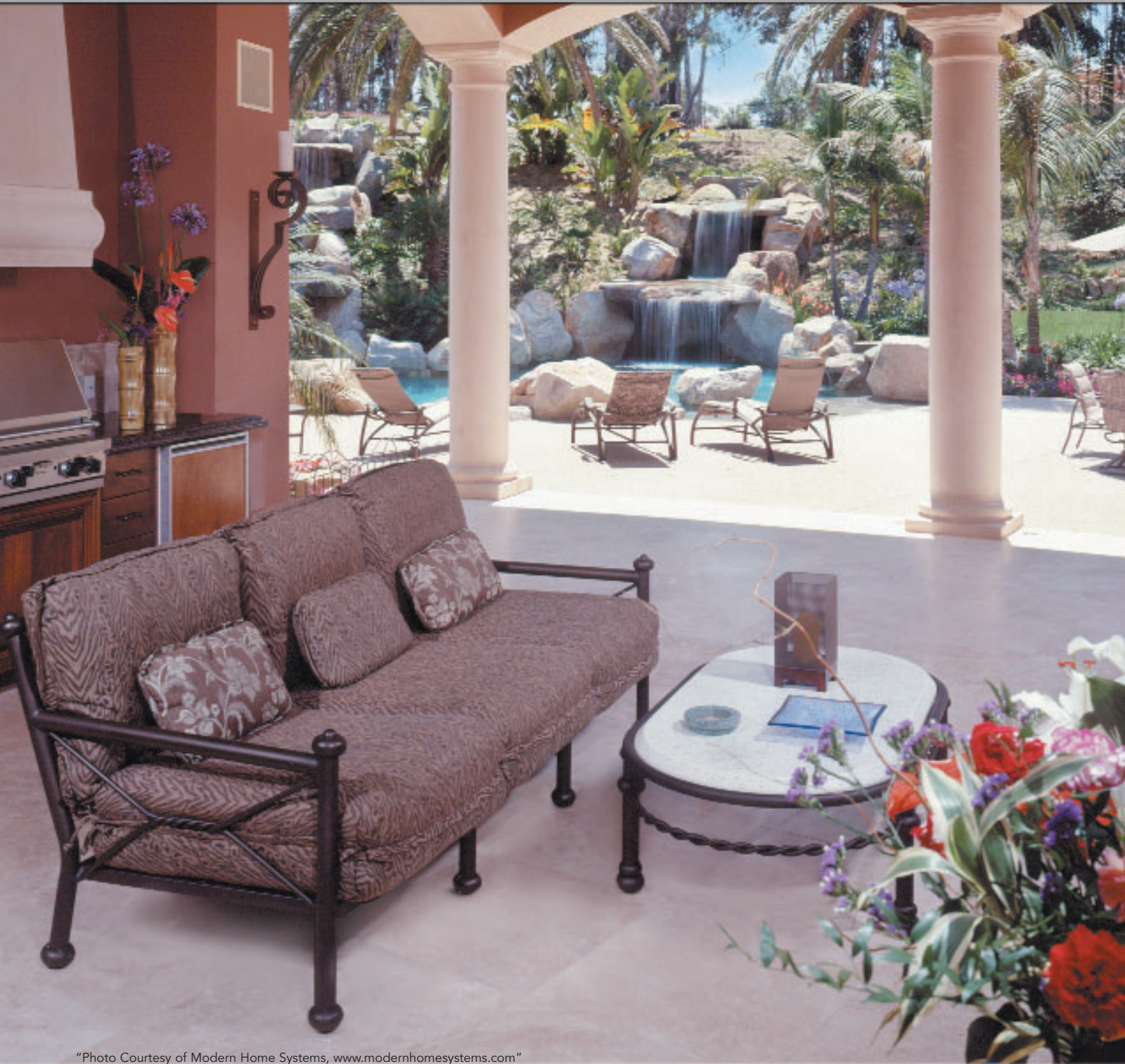
"Photo Courtesy of Modern Home Systems, www.modernhomesystems.com "