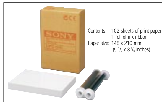
UPC-540/540MD Self-laminating Color Printing Pack