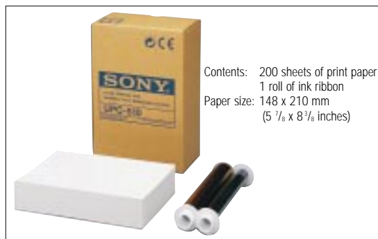
UPC-510 Color Printing Pack