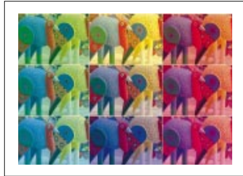
Color adjustment function

A new color adjustment function allows you to easily select the color that most closely matches your requirements. Three alternative gamma curves are also available, so that the one that provides the most suitable tonal range for your application can be selected.