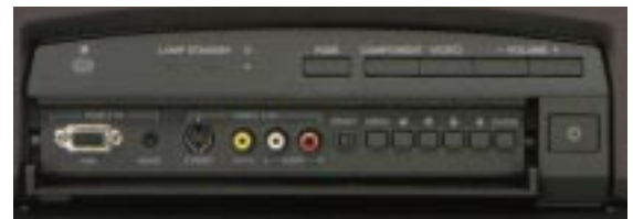
KL-X9200U Front Input/Controls

*Light engine life may vary based on individual usage.