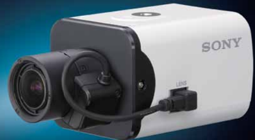
Shown with optional CS mount lens