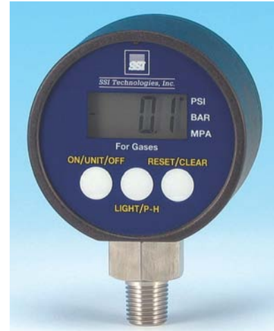
MediaGauge™ Model MG-9V and Model MG-9V-F

The MediaGauge™ MG-9V digital pressure gauge has better accuracy, longer life and standard multiple functions which make it a better choice than mechanical pressure gauges.