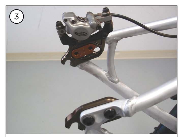
Install the disc brake

NOTE: Make sure the bolt threads and washers are greased.