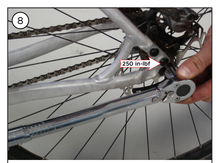
Torque the drive side and non-drive side bolts to 250 in-lbf.

Once the brake and dropout are rotated, make sure the wheel is still centered, then tighten the left dropout so that it's fixed.