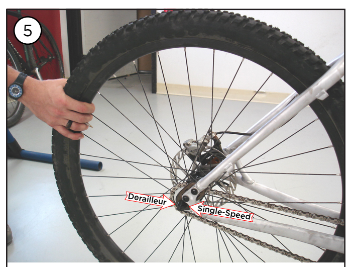
Single-Speed style: Pull the wheel backward, so that the chain is properly tensioned.

Derailleur style: Push the wheel all the way forward.