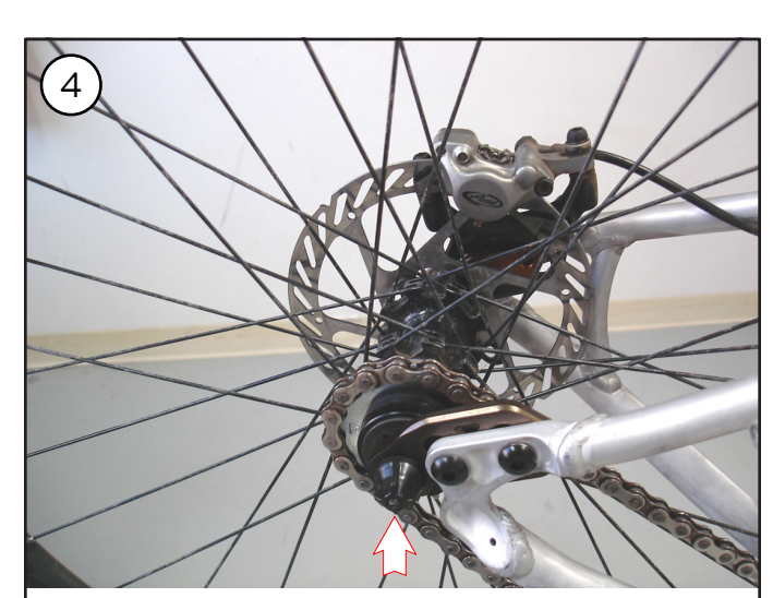
Install the rear wheel in the loose dropouts. Tightening the quick-release will self-align the wheel and dropouts.