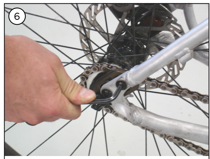
Tighten the two drive side bolts so that they're fixed, but not torqued to specification yet.

Make sure the tire is centered between the chainstays.