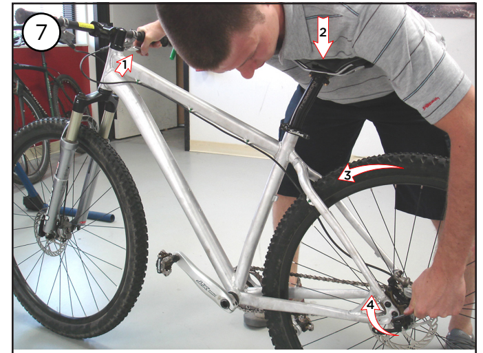
Apply downward force with body weight on the saddle and apply the rear brake, then roll the bike forward slightly. This will rotate the dropout as far forward as possible, so that the dropout won't be able to rotate under braking while riding.

Once the brake and dropout are rotated, make sure the wheel is still centered, then tighten the left dropout so that it's fixed.