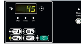
Micro-DISPLAY Control Extra-Large Tub