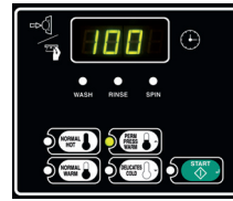
Micro-DISPLAY Control Water Saver Washer