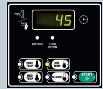
Micro-DISPLAY Control Dryer