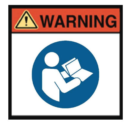
28788 Manual Sticker