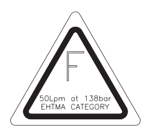
12536 EHTMA "F" Sticker