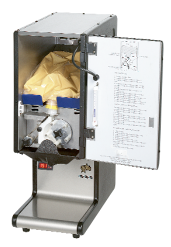
Model HPDE1 (cheese not included)

Star's peristaltic dispensers are covered by Star's one year parts and labor warranty.