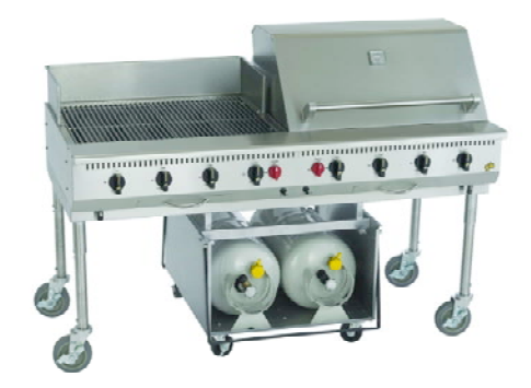
Model OCB60TH with Optional Wind Guard