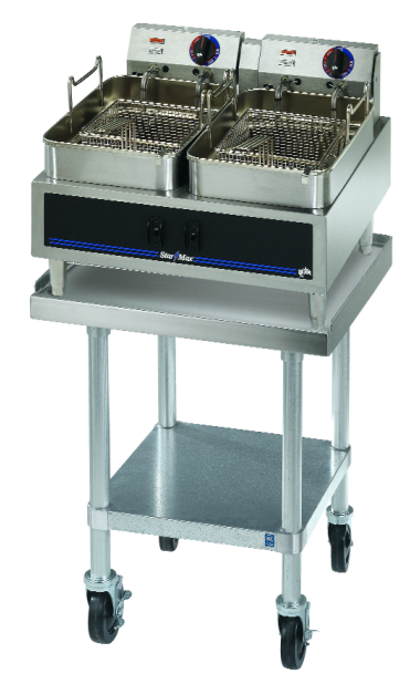
Model 530TD with Optional Equipment Stand and caster kit