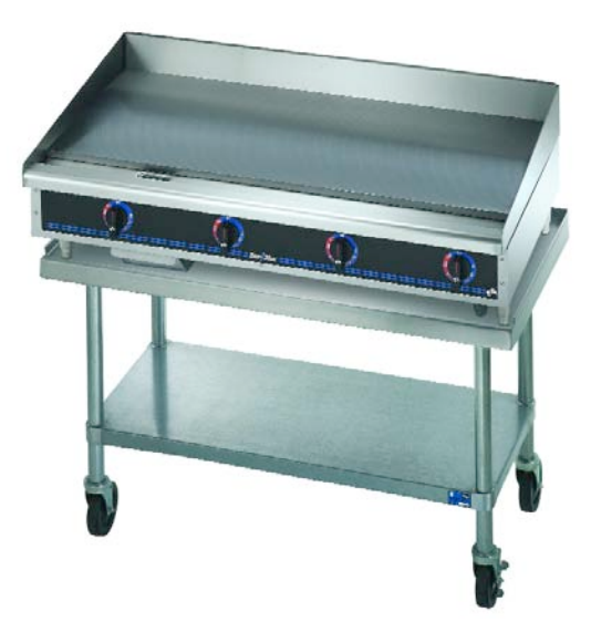
Model 648TSPD with Optional Equipment Stand and Casters