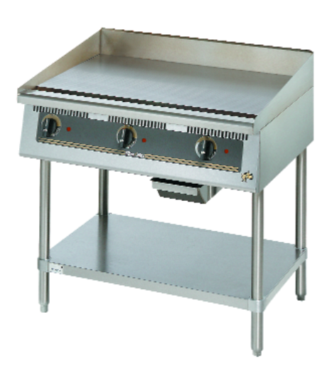
Model 736T Shown with Optional Floor Stand