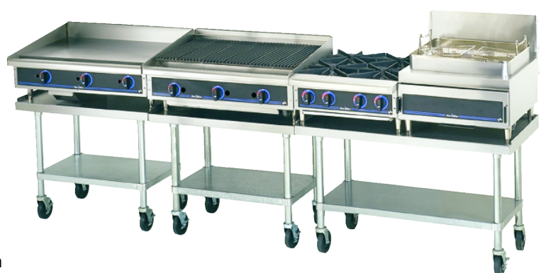
Models ES-SM36S & ES-SM48S

Equipment stands are covered by Star's one year parts and labor warranty.