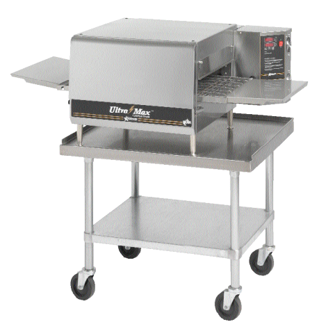
UM-1833A with Optional Stand

Star's Holman Ultra-Max electric conveyor ovens are covered by Star's one year parts and labor warranty.