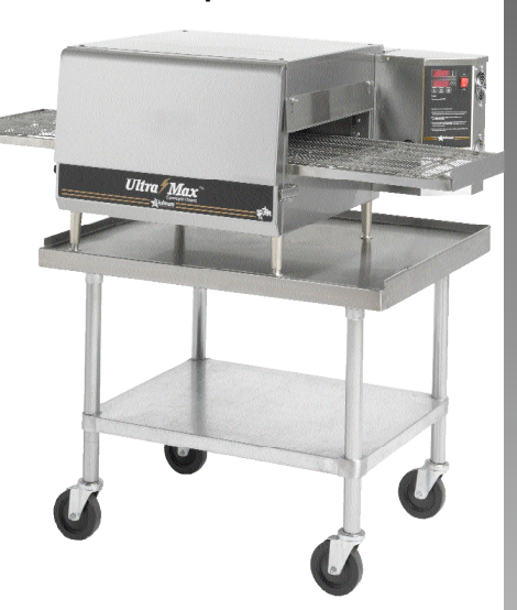
UM-1850A with Optional Stand