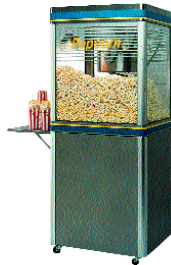
Model G14-Y (14 oz) or G18-Y (18 oz) on Model GPB-14 Base