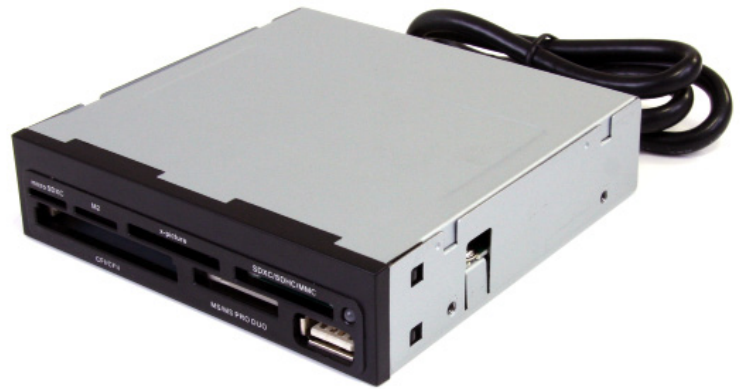
*actual product may vary from photos