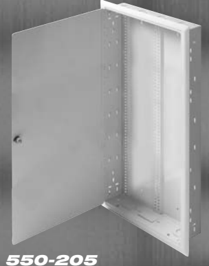
550-205 Medium Flush Mount Enclosure 14<sup>3</sup>/8″(W) x 32″(H) x 3 ½″(D)