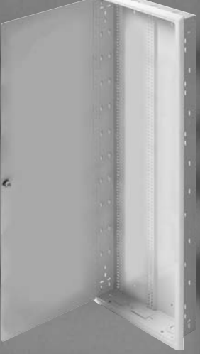
550-210 Large Flush Mount Enclosure 14 <sup>3</sup>/<sub>8</sub>"(W) x 44"(H) x 3 <sup>1</sup>/<sub>2</sub>"(D)