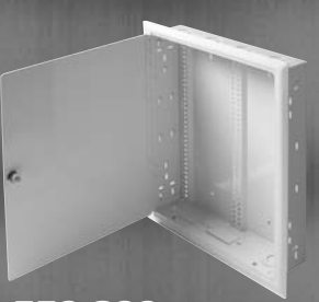
550-200 Small Flush Mount Enclosure 143/8"(W) x 19"(H) x 31/2"(D)