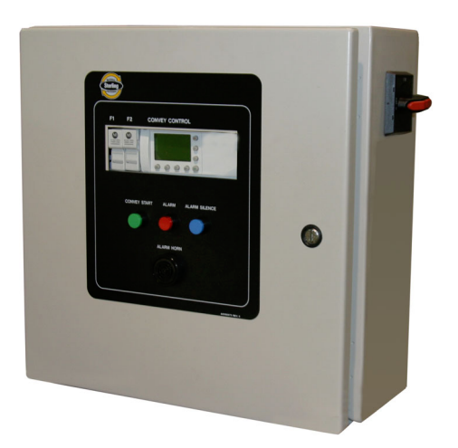
Page 21 of 38

Once power has been applied to a properly installed system, turn the disconnect switch to the ON position. The alpha controller will display the screen for receiver 1 (Hopper 1).