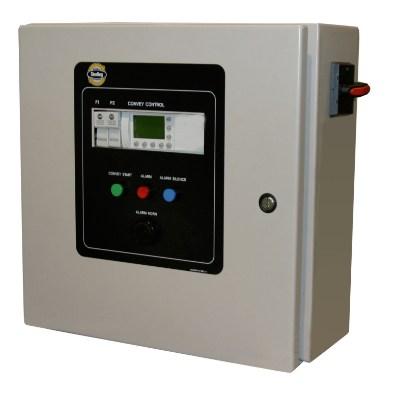
Page 10 of 38