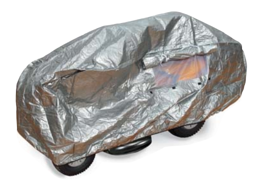
PROTECTIVE COVER Cares for your mower in adverse weather conditions such as rain and snow.