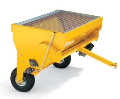
SAND SPREADER Perfect for gravel, sand or salt. Now with more outlets for a more even result. Rear mounted it is controlled electrically from the control panel. Working width 100 cm.