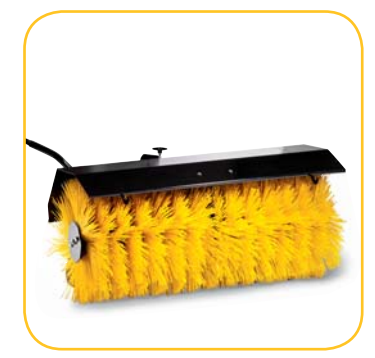
SWEEPER, PTO-kit required