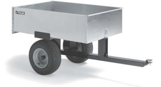
PRO CART Galvanized steel. Removable rear tailgate and good dump angle, 200 kg load capacity.