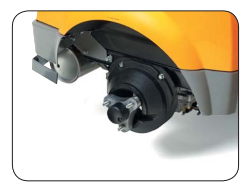
FRAME WEIGHTS Improve balance and provide ultimate traction to the mower, 2x17 kg for Park and 2x13.5 kg for Villa.

FRONT WEIGHT/ REAR WEIGHT ESTATE Easily fitted on the front or rear of your tractor, the weight kit increases stability of the machine when using it with towed or front-mounted implements. Front weight: 11.5 kg Rear weight: 23 kg (ballasted with sand)