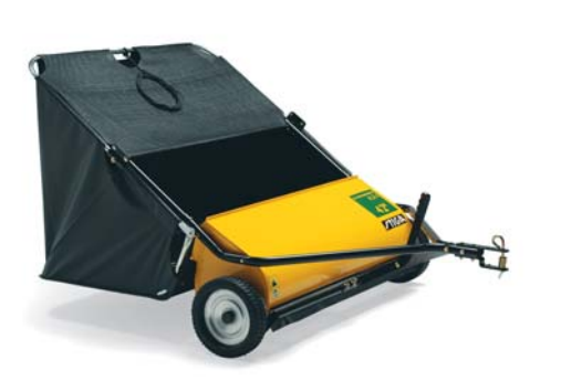
GRASS AND LEAF COLLECTOR 42" Towed, self-propelled with 1:8.5 ratio of the wheel to brush, 107 cm working width. Easy to empty from driver's position. Aluminum wheel transmission and heavy-duty bag stretcher.