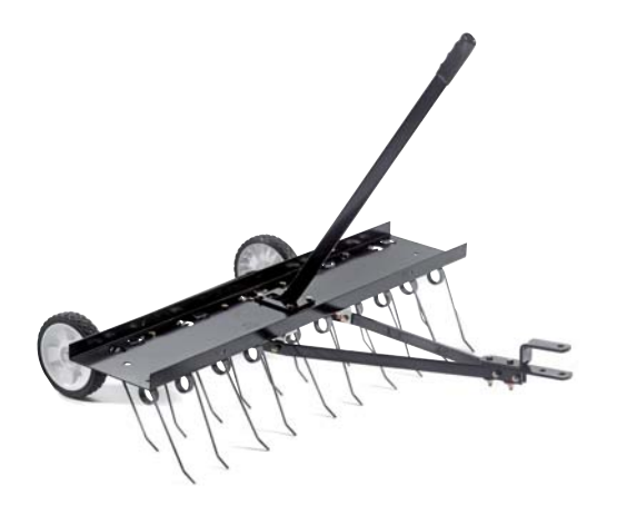
TOW RAKE ESTATE Clears paths and garden from thatch and moss, dead leaves and grass clippings. Twenty tines, heat-treated and spring-loaded,