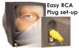
Easy RCA Plug set-up

Spy Eye, SVAT and "now you can see" are trademarks of SVAT Electronics. ©2005 SVAT Electronics. All Rights Reserved