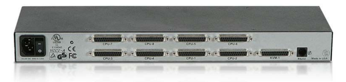
UKT-KVM-1U08-Z Rear Panel

Connect each computer to the KVM using the appropriate server cable (see below).