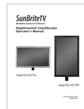
Supplemental* TouchScreen Operator's Manual