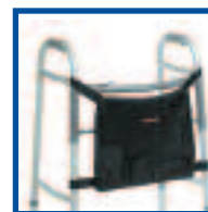
Front Pouch Model 7741