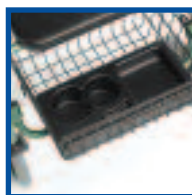
Basket Organizer Model 7878