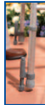
Glidebrakes™ Model: 7732G (1" retail)