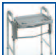
Folding Flip Tray-Open Model 7850