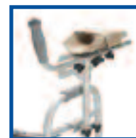
Platform Attachment Model 7702 (Adult) Model 7703 (Youth)