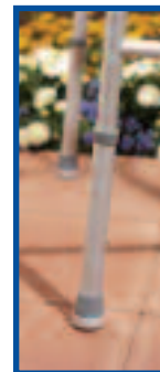
Glide Caps Models: 7904 (retail) 7900 (bulk)