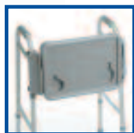
Folding Flip Tray-Closed Model 7850