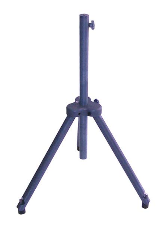
The TDK RF Solutions TRI-150R Tripod is specifically designed for EMC test environments and can support up to 45 kg.