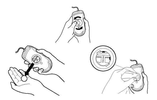
Figure 4. Removing and cleaning the mouse ball