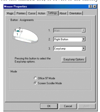
Figure 2. Mouse Properties Window

Button Swap: assign the right button to be the primary mouse button for left-handed use, or revert to the factory setting.