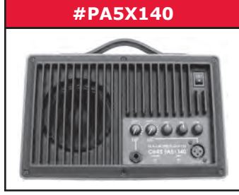
#PA5X140 Powered Hot Spot #SA-1 Stand Adaptor Included

#PA5X140 POWERED HOT SPOT ......Retail $399.95..... $CALL