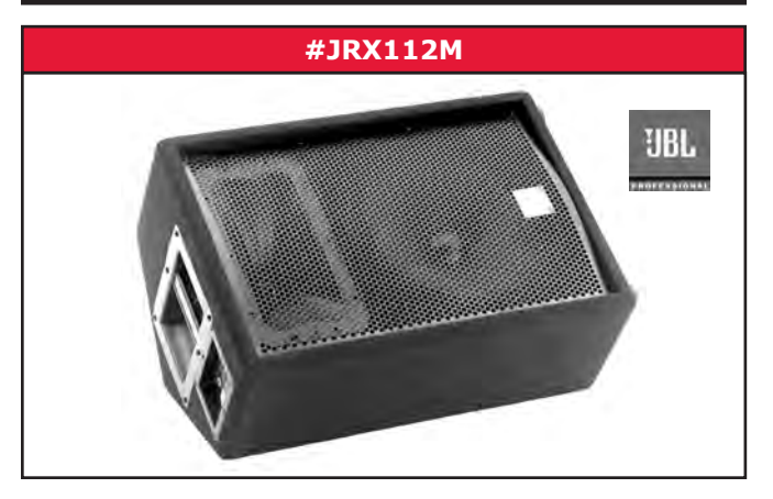
#JRX112M ECONOMY SPEAKER and/or MONITOR 12" 2-Way, 250w/1000w Portable Speaker System or Stage Monitor Retail $379.00 ........ASL $CALL