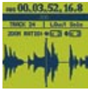
Waveform screen with variable zoom.