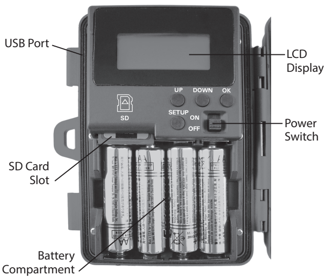
Control Panel (Front Unlatched & Opened)