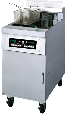
18UE with optional computer and casters