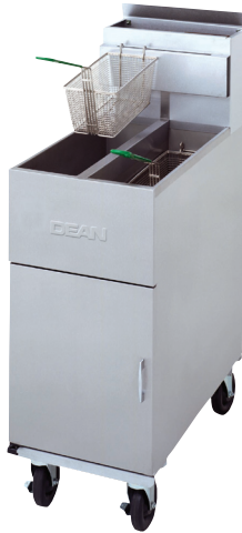
SM20-2 Shown with optional casters.