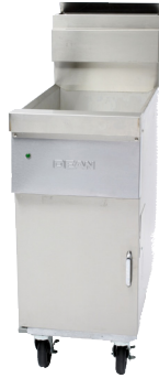
HD50G Shown with optional casters

*Matching cabinet required for optional filtration.