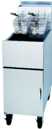
SM50G Shown with optional casters.