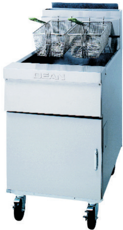
SM80G Shown with optional casters.