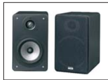
Accessory: e.g. TEAC LS-H255