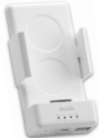
myTune FM with mounting clip