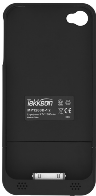
myPower for iPhone 4