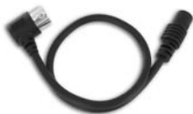
Right angle output cord, 9"