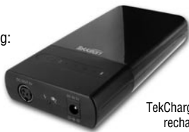
TekCharge MP2250 rechargeable mobile power