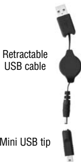
Retractable USB cable