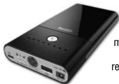
myPower ALL Plus lithium polymer rechargeable battery