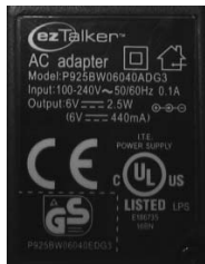
Sample Power Adapter Label