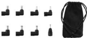
Adapter plug kit with drawstring bag (8 adapter tips)