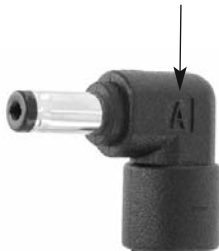
Output Adapter Marking