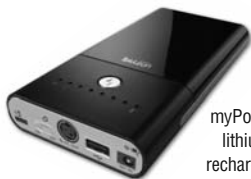
myPower ALL Plus lithium polymer rechargeable battery