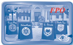
Music On/Off icon

To turn the background music on or off, touch the Music On/Off icon on the cartridge menu.