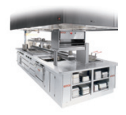
Heavy Duty and Custom Suites

Vulcan leads the industry in helping professional kitchens of every size operate efficiently, cost effectively and competitively throughout the world. For over 130 years, Vulcan has combined superior manufacturing with state-of-the-art technology to give chefs the ultimate in creativity and control. Vulcan has the broadest line of commercial cooking kitchen products and offers unparalleled service and support in every part of the country. We are "One Powerful Package." TM