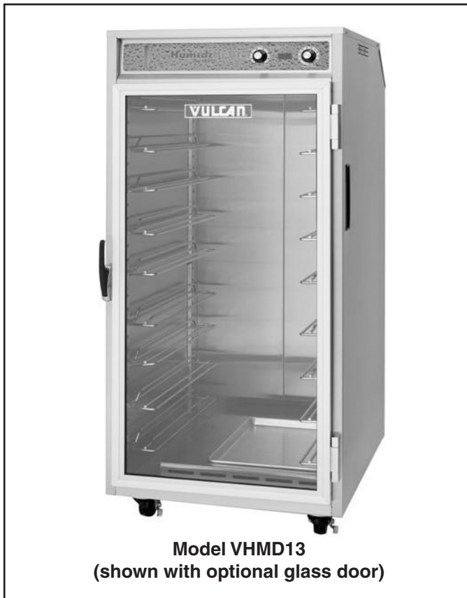
Model VHMD13 (shown with optional glass door)