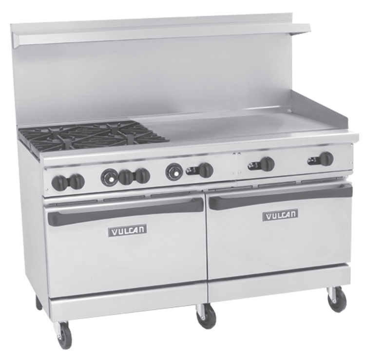
Model G60SS-4FT36 shown with optional casters