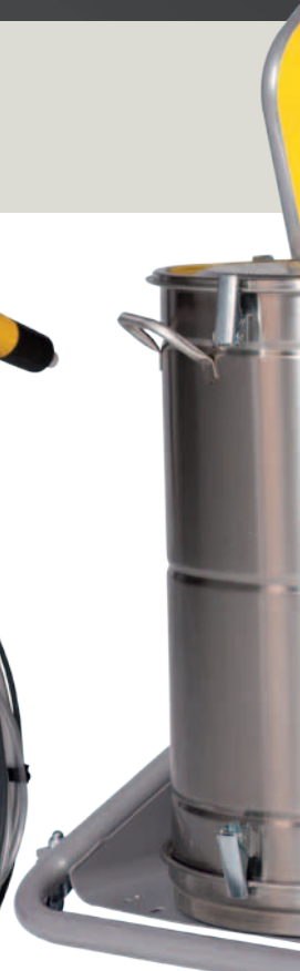
60 l Model