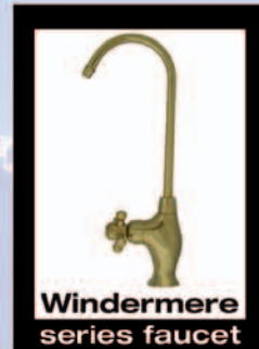
Windermere series faucet