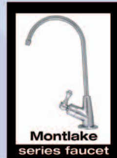
Montlake series faucet