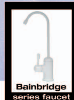
Bainbridge series faucet