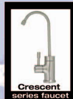
Crescent series faucet