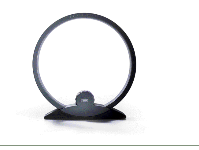
Tower :: Amplified, AM/FM Indoor Antenna