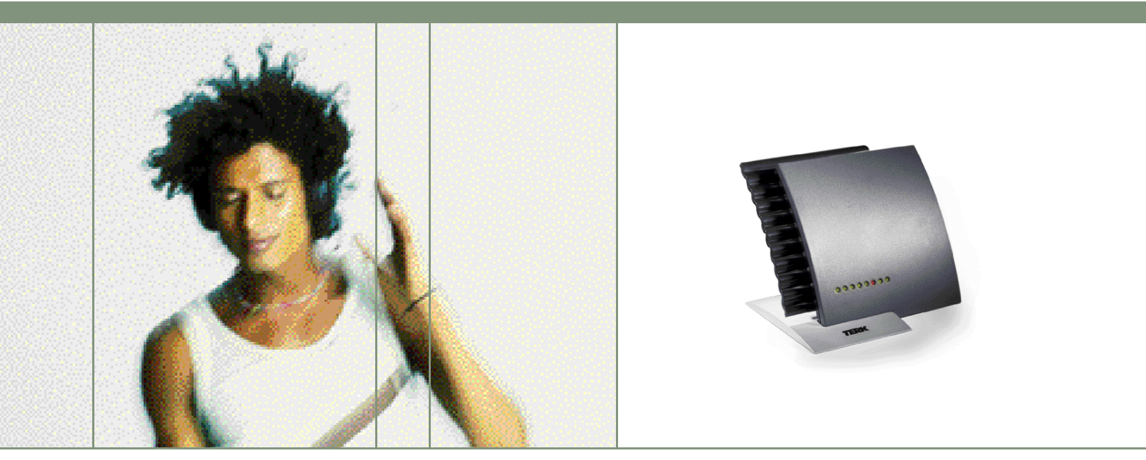
Q:: Amplified Indoor FM Antenna