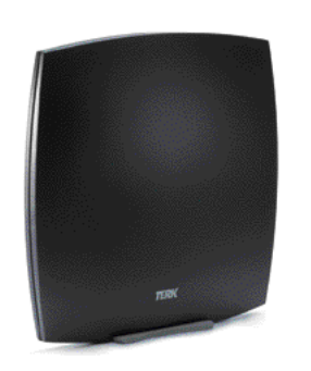
AM/FM+:: Indoor AM/FM Antenna