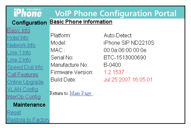
Fig 2: Teledex iPhone Configuration Portal

NOTE : Except for upgrading the software online (decribed in subsection 3.2.7), the configuration for the SIP ND2100 series will not be activated until the phone has been reset.