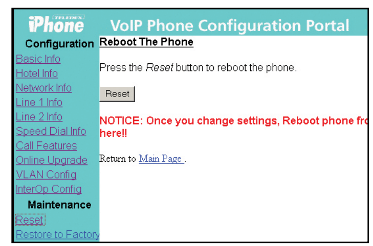
Fig 7: Reset the Phone

NOTE: Except when upgrading the software online (described in section 3.2.7), the phone should be reset after modifying any configurations.