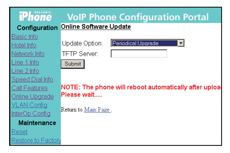
Fig 6: Online Software Upgrade

NOTE: For update options 2 and 3, do not reboot the phone manually. Wait for the phone to reboot itself.