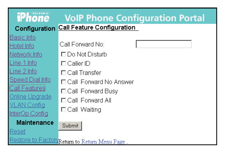
Fig 5: Call Feature Configuration